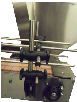
Knobs for Adjusting Conveyor