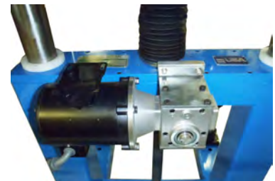
Motorized Machine Height Adjustment