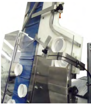
Cap Elevator Sorter