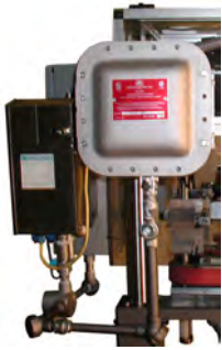
Explosion Proof Kit Class 1 Div 1 Rating Shown on Machine