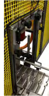
No/High Cap or No Liner Detection