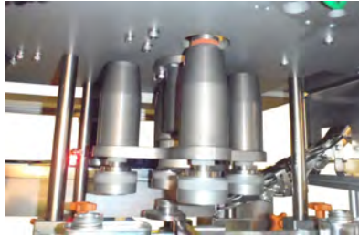
Stainless Steel Kit and Hardcoat Anodizing