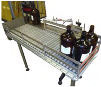
Rejection Station for No/High Cap, or No Liner