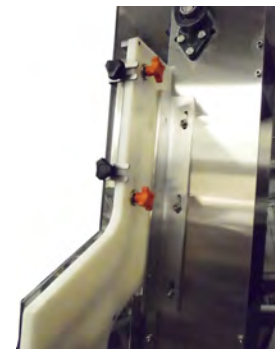
Knobs for Adjusting Overflow Rail